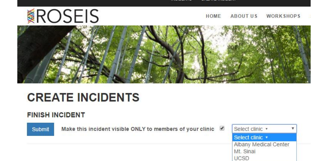
Figure 17 User who is a member of multiple roles

Also, if the user is a member of multiple clinics/roles, incidents from all of his clinics/roles will be displayed in the results and statistics.