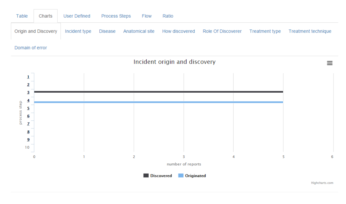
Figure 9 Charts